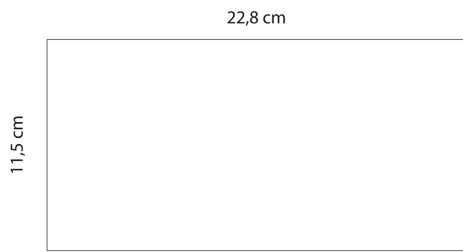
PRINTING AREA (ROUND PRINT)