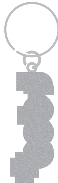
BACK GRITTY NICKEL PLATING